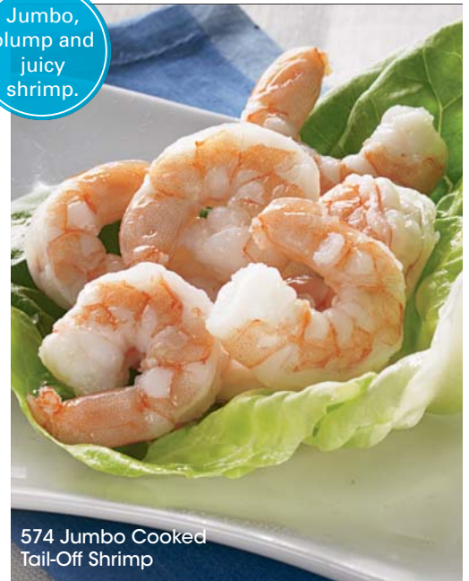
574 Jumbo Cooked Tail-Off Shrimp