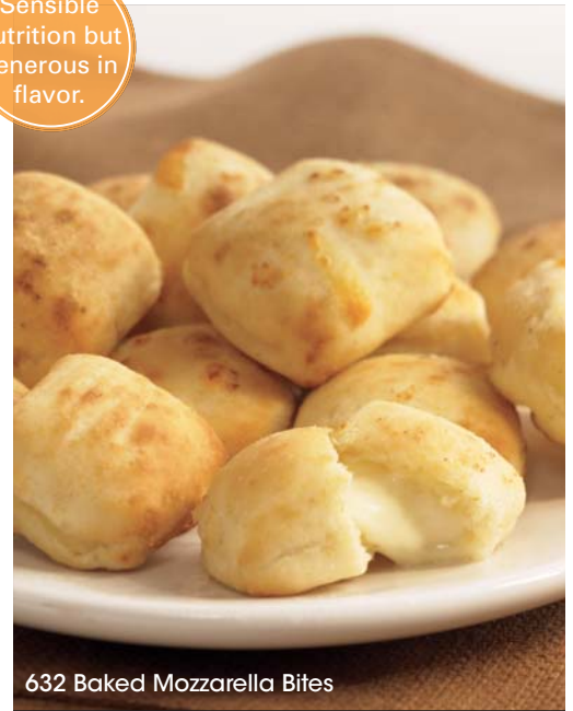
632 Baked Mozzarella Bites

Sensible nutrition but generous in flavor.