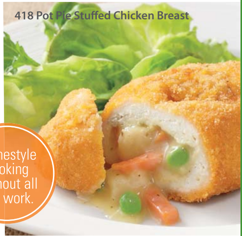
418 Pot Pie Stuffed Chicken Breast

LIVESMART™ foods are the kind you'd make for yourself – if you had time to research ingredients, shop multiple stores, read labels, compare prices and chop, cut, dice and prepare meals from scratch. Luckily, the LIVESMART™ brand team of chefs, nutritionists and health experts has done it for you. All you have to do is sit back and enjoy it. Enjoy the foods, the flavors and the variety, because you've chosen a smarter way to live.