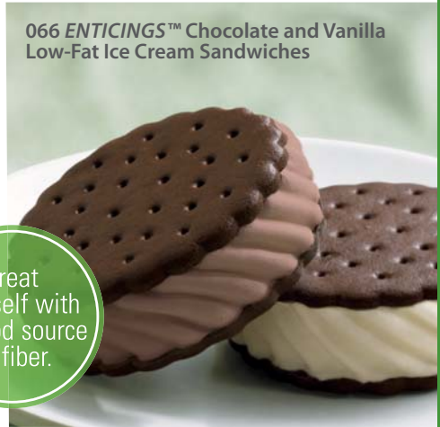
066 ENTICINGS™ Chocolate and Vanilla Low-Fat Ice Cream Sandwiches

Treat yourself with a good source of fiber.