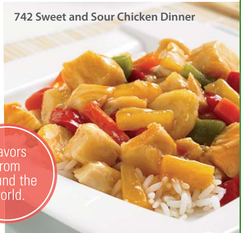
742 Sweet and Sour Chicken Dinner

Treat yourself with a good source of fiber.