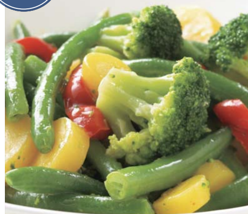
800 Lemon Garlic Seasoned Vegetable Blend