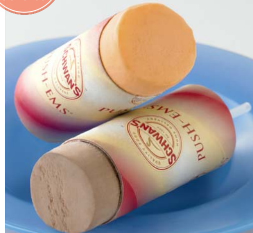
010 PUSH-EMS® Chocolate Malt 013 PUSH-EMS® Orange Sherbet

Controlled in calories with 0g trans fat.